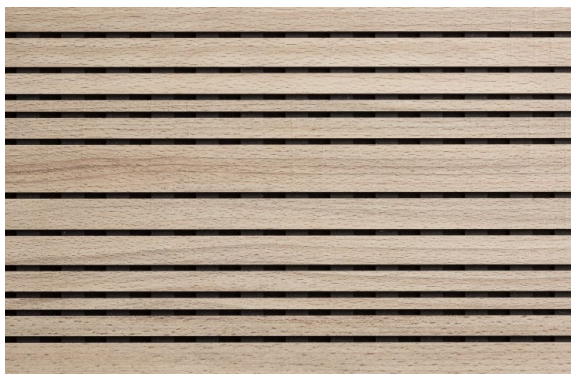
Absorption data for Groove R (EN 354: 2003)